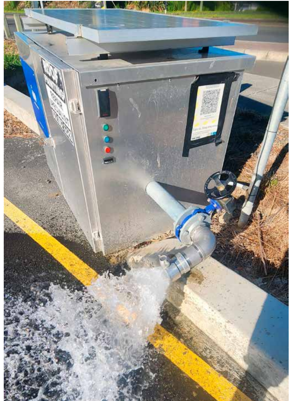
Coastal Purewater's hydrant delivers clean, clear water from an aquifer 275m below ground.