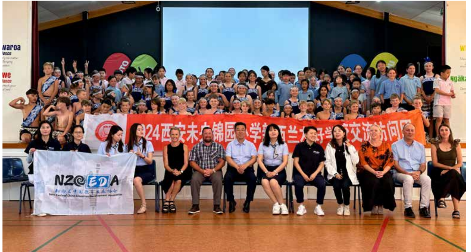
Maraetai Beach School welcomes staff and students from Weiyang Jinyuan Primary School.

"They learn to understand and respect different traditions, customs, languages, and perspectives, fostering cultural awareness and sensitivity. Cultural exchanges challenge children to adapt to new environments, overcome language barriers, and navigate unfamiliar