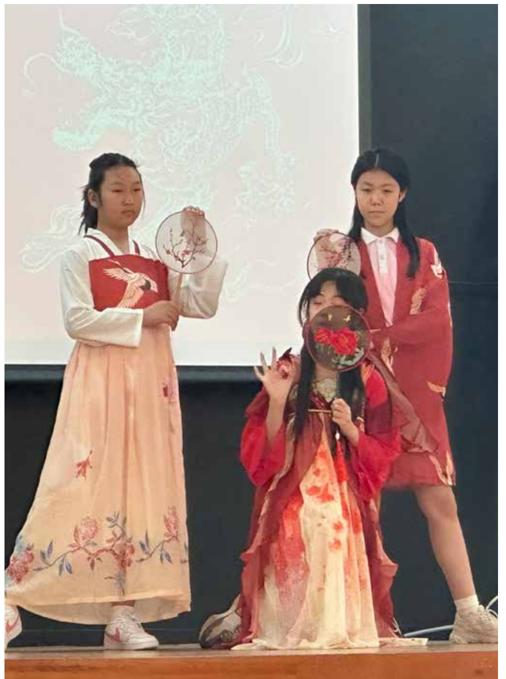
Students from Weiyang Jinyuan perform a contemporary Chinese dance.