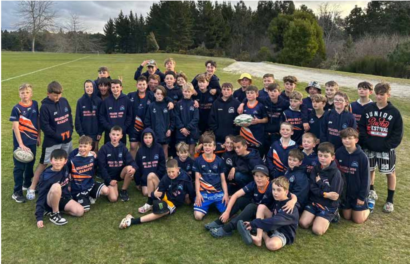
Junior players from Beachlands Maraetai Rugby Club pictured at the recent national tournament in Taupo.

Beachlands and Maraetai's young rugby players have played their hearts out to win more awards at national tournaments over the past season than any other club in the country.