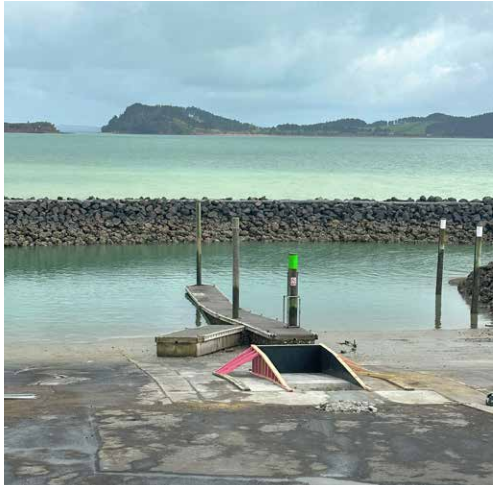
Work is underway to replace the pontoons at Kawakawa Bay Boat Club

During the temporary closure, boaties can still launch from the Kawakawa Bay's