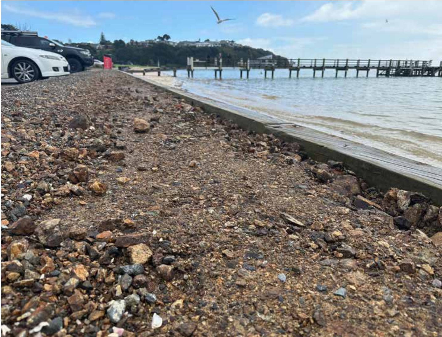
Auckland Transport's repairs to the loose metal pathway at Maraetai beach are washed away with every storm surge.

Auckland Transport says it is investigating a more sustainable and durable alternative to the use of loose metal on top of the Maraetai seawall.