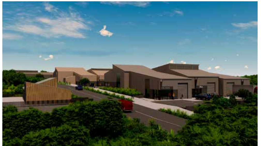
Artist's impressions of the new Pōhutukawa Business Park.