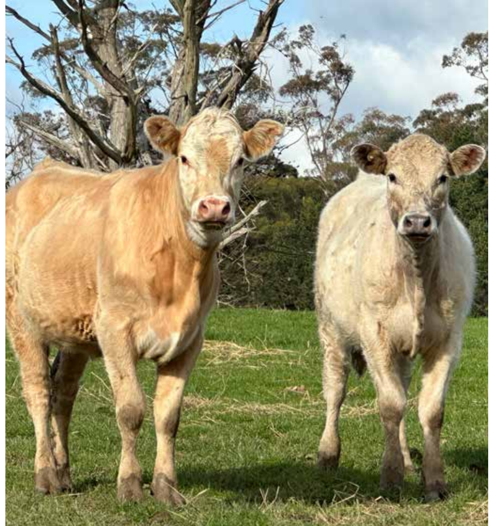
Livestock will determine the winner of a $5,000 cash prize on offer from Beachlands Maraetai Rugby Club.

https://events.humanitix.com/bmrc-cow-bingo