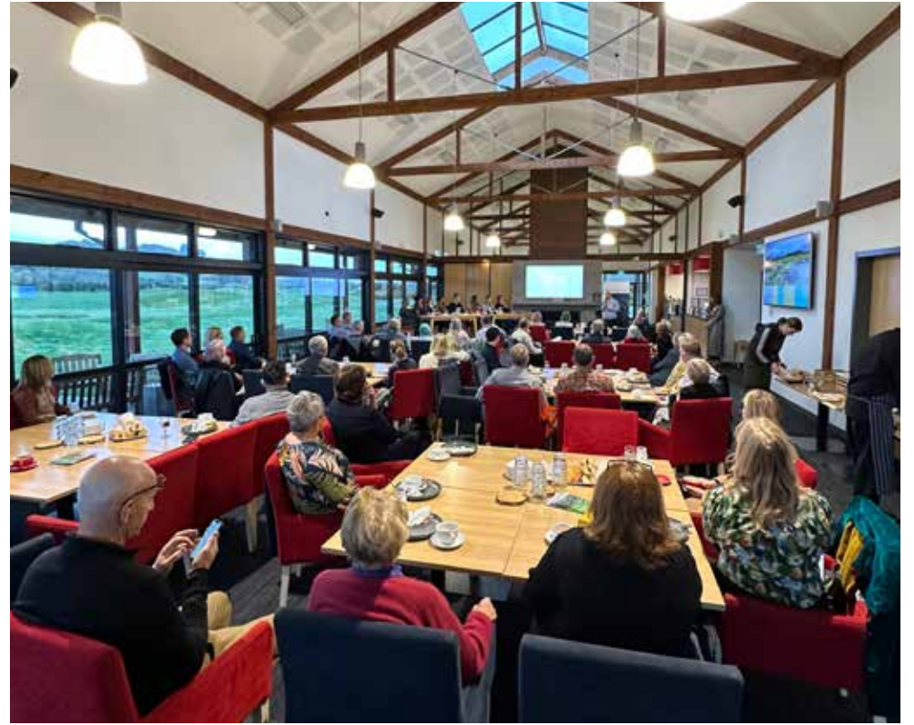
Members of Clevedon's Community and Business Association heard from local land developers at a breakfast meeting held at Windross Farm Golf Course.

Both developers acknowledged the work done by Clevedon Community and