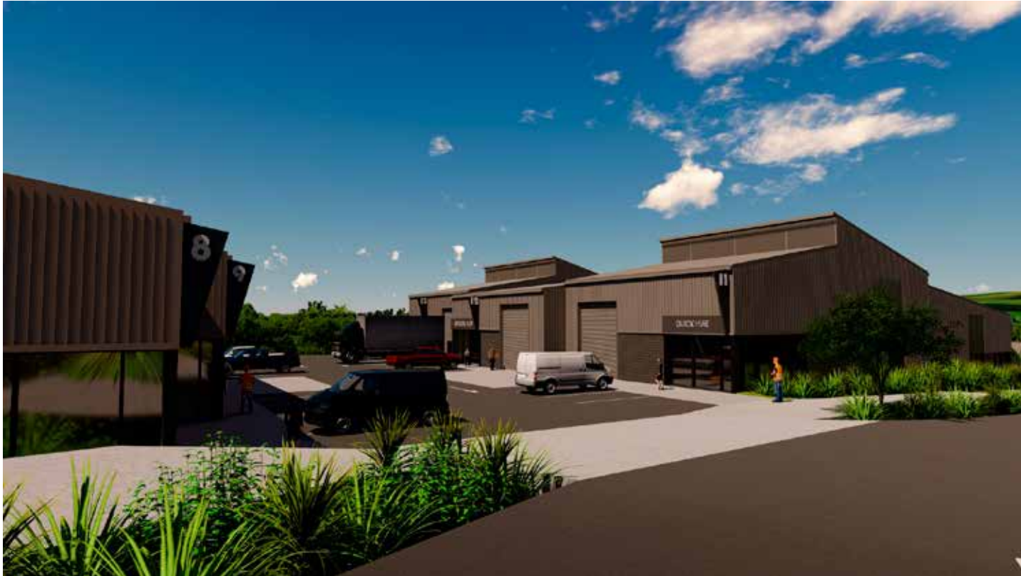
Artist's impression of the new Pōhutukawa Business Park which will be developed on the site of the existing Beachlands Quarry over the next two years.

A new business park will be built at the site of the existing Beachlands quarry on Whitford Maraetai Road.