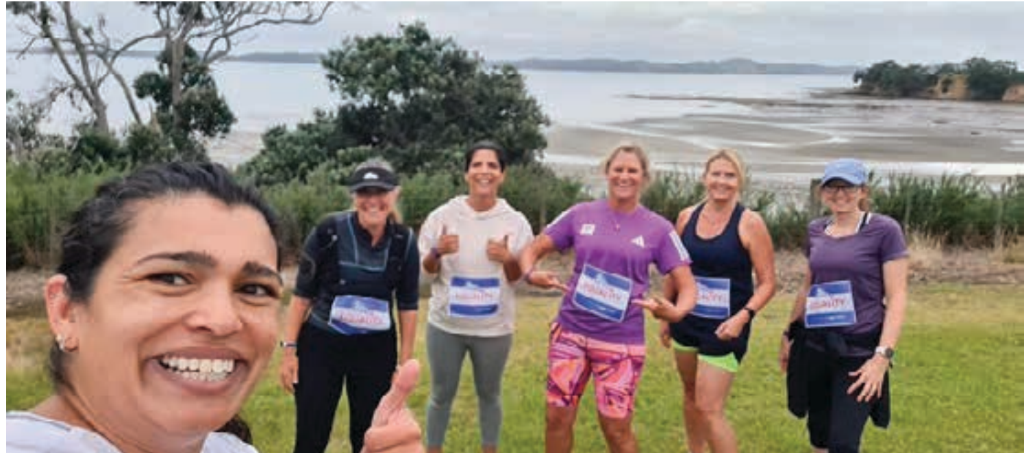
Members of the Coast's new 261 Fearless running group are taking positive steps towards their well-being.

Anna says the group would love to increase frequency of its "meetruns" if offered, and is looking for more women keen to train as coaches to enable the group to do this. "Our next Train the Trainer weekend is in Auckland early next