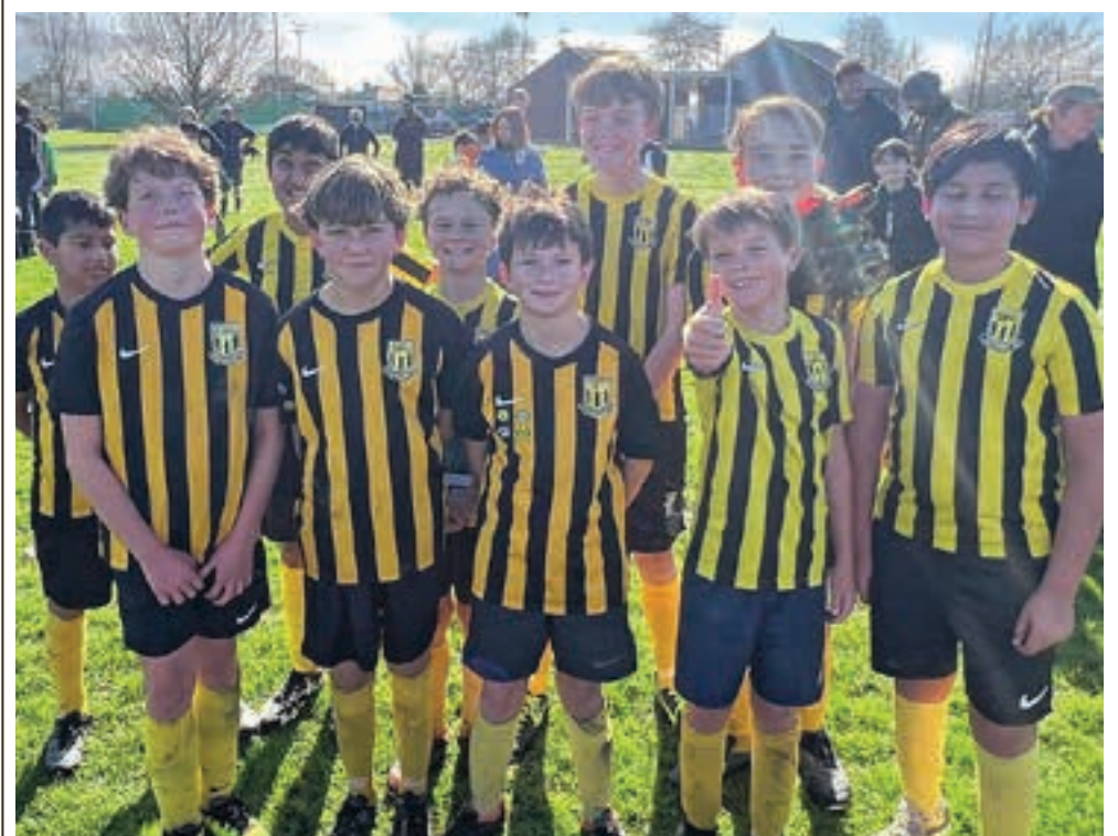
Above: U12 Cheetahs