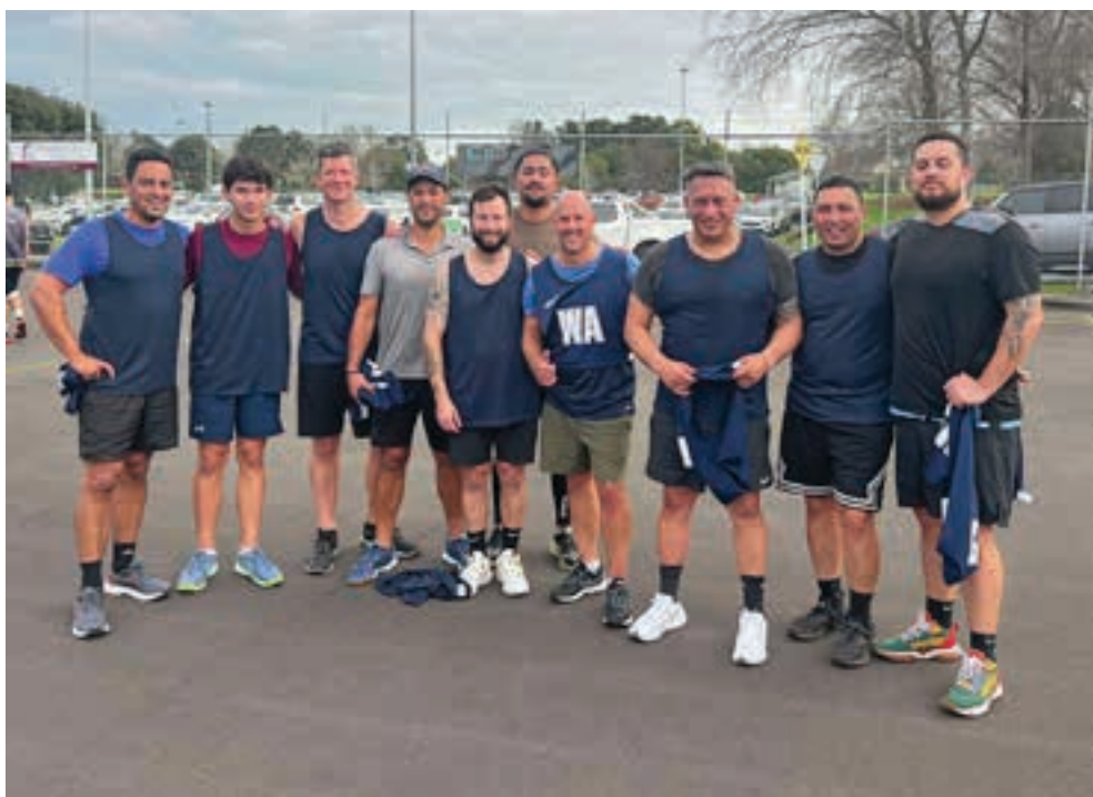
Above: PCNC Men's team

Premier vs Livewires: S1 Kauri - Loss 35 - 44 - POD Mikayla Hihi vs Te Ruapotaka Whanau Black - Win 39 - 23 Falcons vs Monster Boot Camp: S1 - Win 50 - 16 - POD Danielle Boettcher Wekas vs Pakuranga: Cougars - Loss 19 - 31 Pukekos vs Sunnyhills: S6 - Loss 21 - 36 Kererus vs Mellons Bay: S8 - Win 21 - 18 C1 vs Mellons Bay: C3 - Loss 20 - 28 - POD Eden Craig C2 vs Shelly Park: C6 - Loss 26 - 34 J1 vs Mellons Bay: J1 - Loss 17 - 45 - POD Sienna Blase J2 vs Monster Boot Camp: J1 - Loss 13 - 36 - POD Eva Dowie J3 vs Mellons Bay: J4 - Loss 8 - 21 J4 vs Shelly Park: J4 - Loss 5 - 17 - POD Georgie J5 vs Mellons Bay: J6 - Loss 9 - 14 - POD Sienna Fantails - POD the whole team Tuis - POD Esther Keas - POD Thea Colenso Kiwis - POD Sammy, AWHI Abby Silvereyes - POD Mila