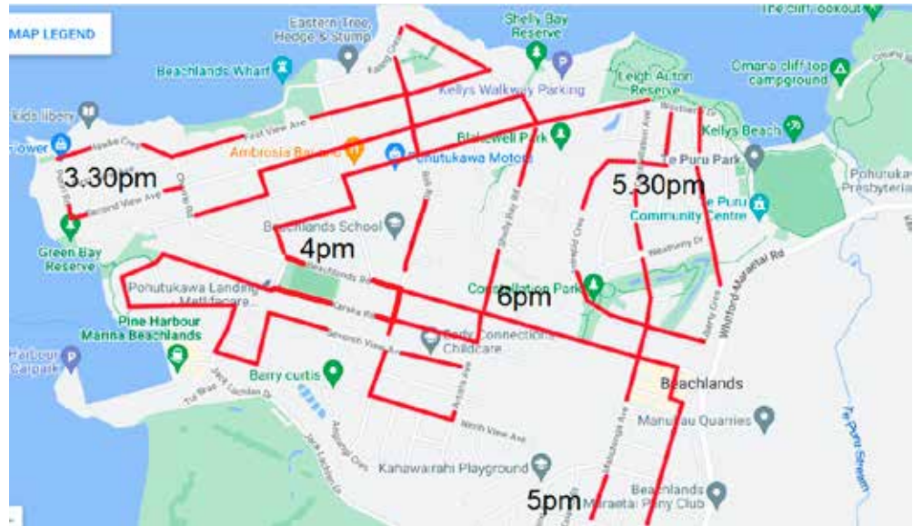
Beachlands Volunteer Fire Brigade's lolly run routes for Beachlands (above) and Maraetai (below).

Time constraints mean that the brigade cannot visit every street, so see the maps on the right for the proposed routes.