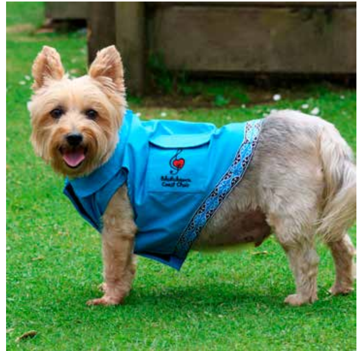
Ku's custom-made choir coat was made by an Ormiston tailor.