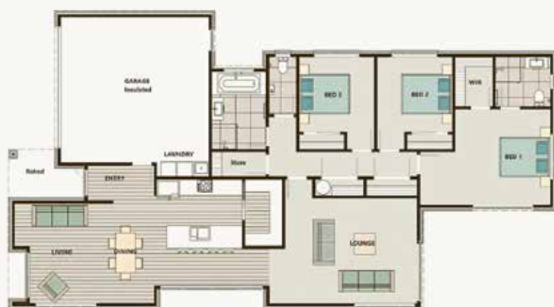
Floor Plan © G.J. Gardner Homes 2024