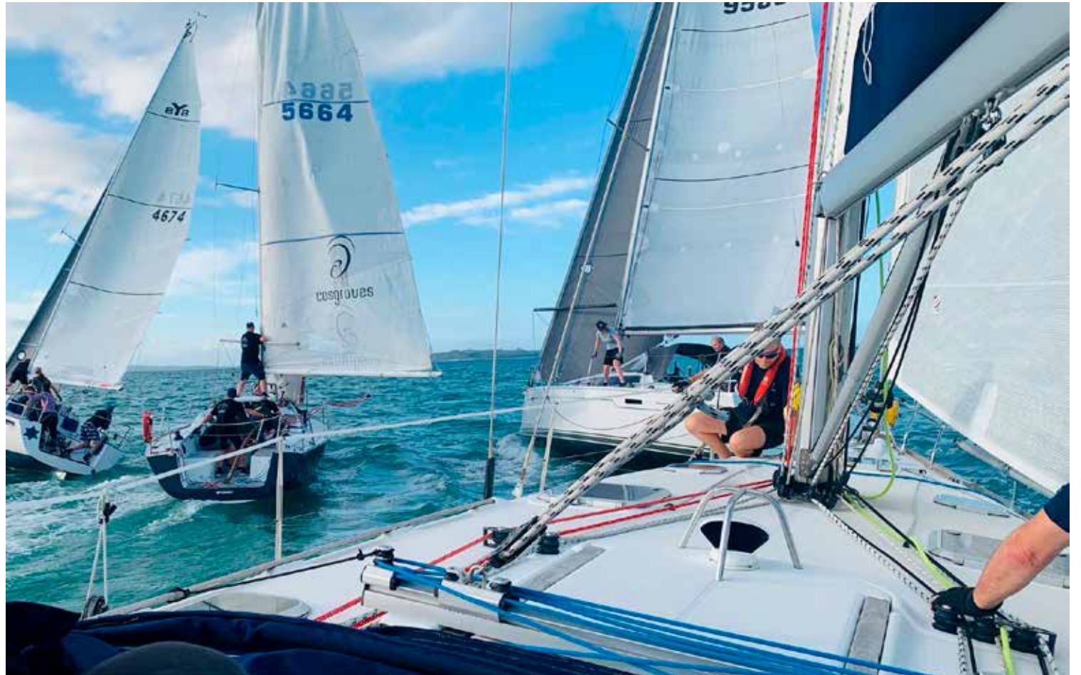
Pine Harbour Cruising Club members enjoy a race event on the Hauraki Gulf.

Harbour who don’t belong to the club but maybe you should give it a try. It’s a great way to join a friendly bunch of welcoming boaties.”