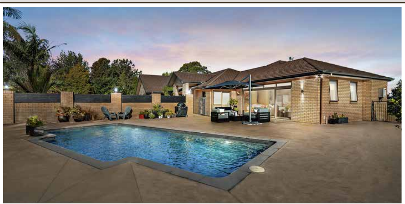
12 Potts Road, Whitford $7,295,000

OPEN HOMES - SATURDAY 9 NOVEMBER & SUNDAY 10 NOVEMBER 2024 - SEE INSIDE BACK COVER