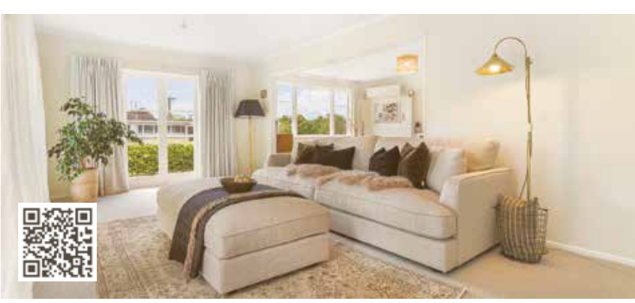
RayWhite. 23 Hawke Crescent