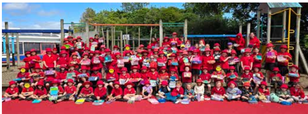
Hūnua School students show off their plastic-free lunch boxes

environment. Through their plastic-free campaign, they hope that families will think more about how much single-use plastic they are buying and find ways to reduce it.