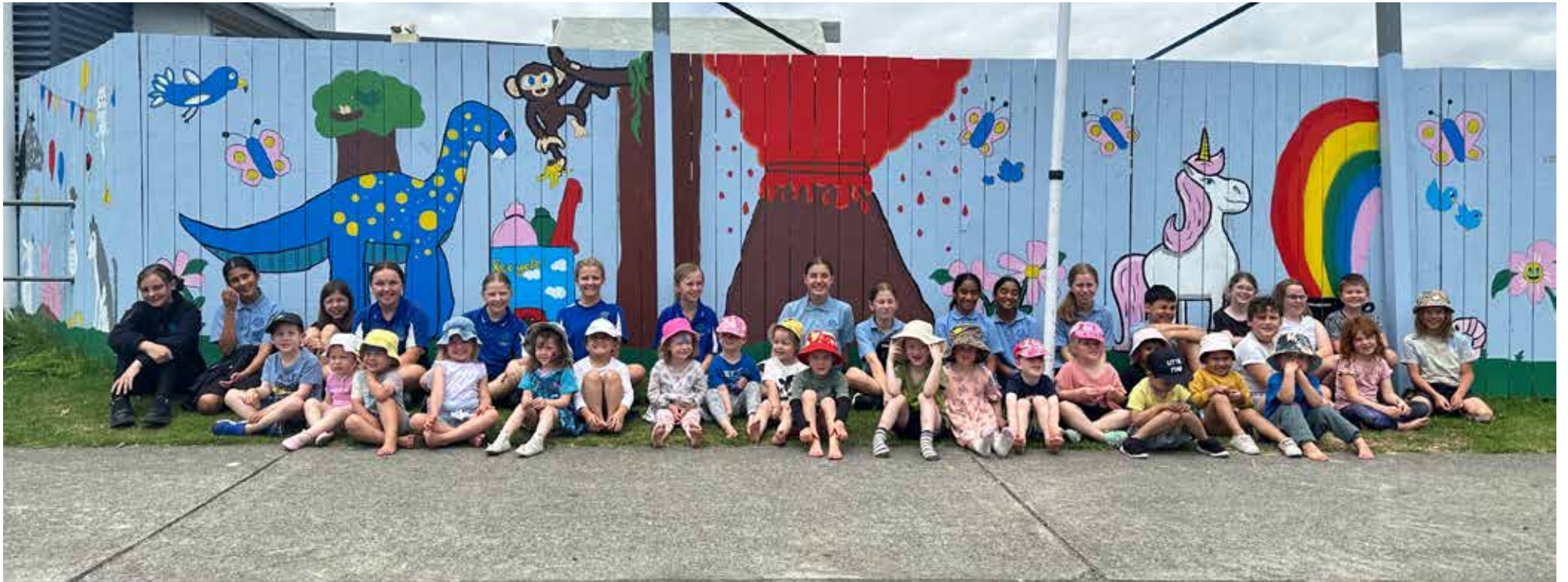
The new mural on Second View Ave in Beachlands is a collaborative effort between local schools, home schoolers and pre-schoolers.

A collective effort between Beachlands School, Maraetai Beach School, members of the local home schooling community and Pōhutukawa Kidz pre-schoolers has resulted in a colourful new mural on Second View Ave in Beachlands.