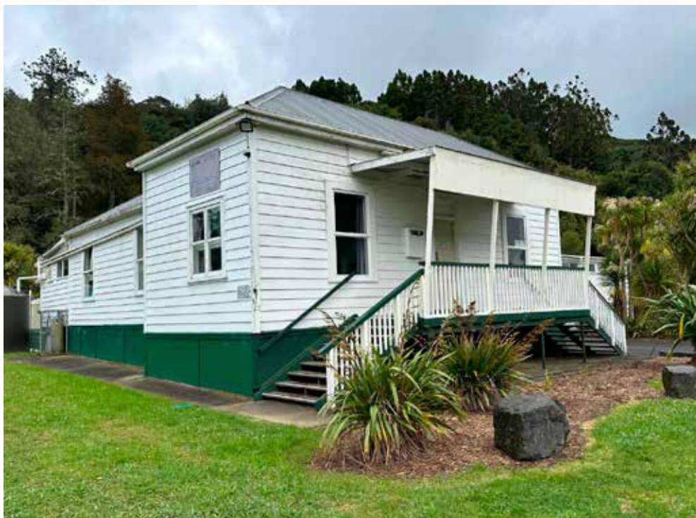
The Scouts-owned building at Clevedon's Camp Sladdin will once again be available for hire.