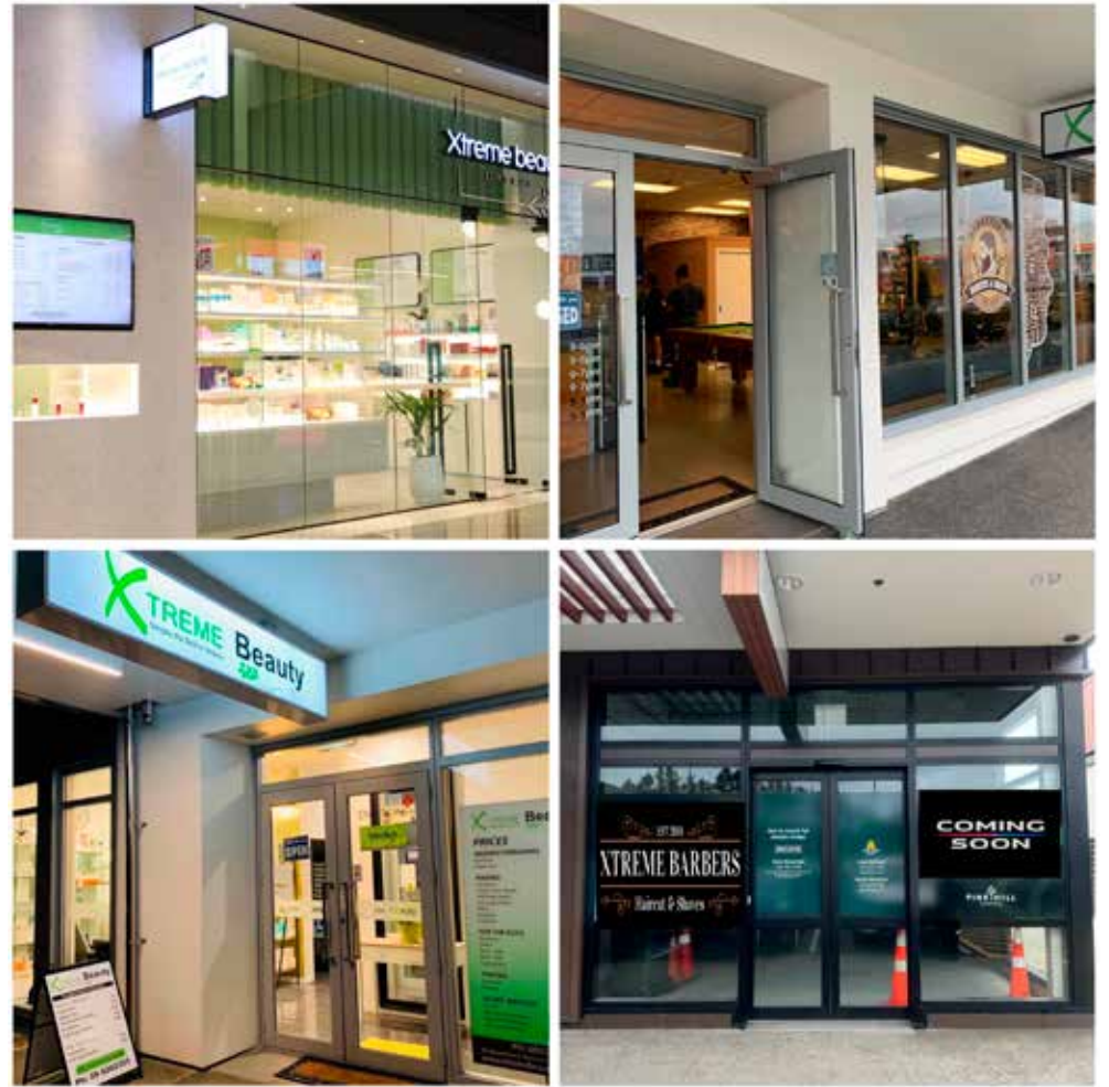
Xtreme Beauty and Barbers now boasts four locations across Auckland.

Kesh encourages people to start booking in advance as the busy season approaches next month. Online booking is now available for both beauty locations at www.xtremebeauty.co.nz .