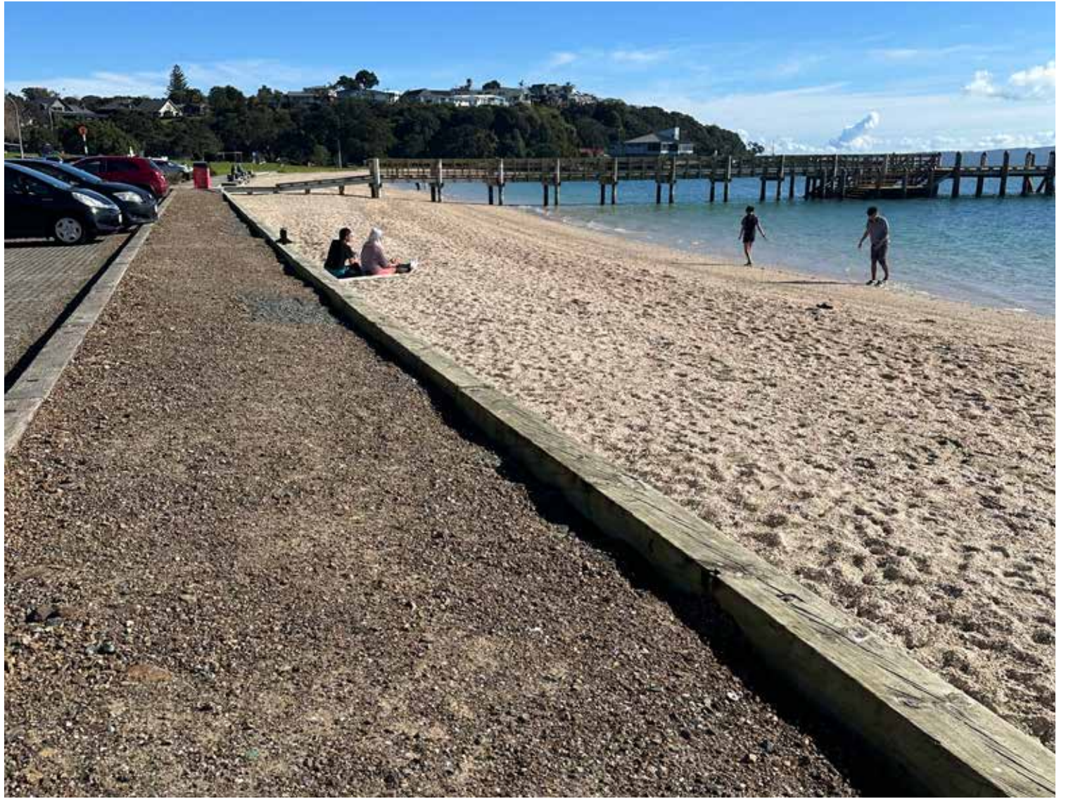
Maraetai's existing seawall has not fared well under the onslaught of storms and king tides.

The project is in its early stages and is undergoing a planning and design phase and engagement with mana whenua, with any construction required not envisaged to start until December 2025.