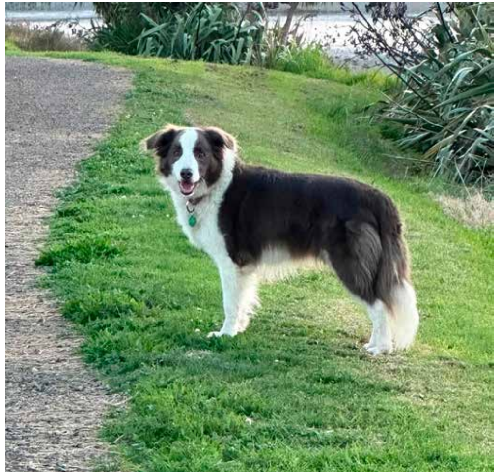
Arrow’s senior years will be more comfortable now that he’s lost excess weight.

Our team was so proud of Arrow and his owner for putting in the hard yards to ensure Arrow’s senior years are happy, healthy, mobile, and pain-free.